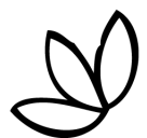
Baby Chick Feet